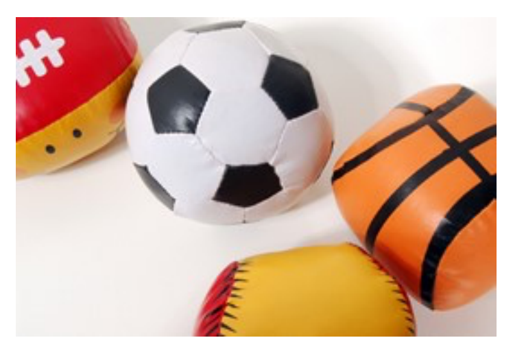
Skills General Hints and Tips

Ball skills are a very complex set of skills to learn. Children who find ball skills difficult need lots of practice so vary the activities you try so that they don't get bored. Always finish on a positive note with them having some success to avoid frustration. You might need to make the activity easier to allow them to succeed.